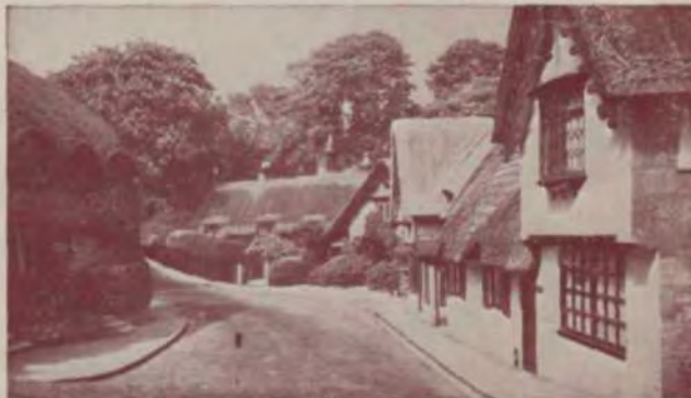
SHANKLIN—The Old Village.

During the season numerous coach tours are arranged for visits to many places of interest in the Island, including the famous beauty spot Blackgang Chine, Carisbrooke Castle, Osborne House, Shanklin, Sandown, Ventnor, etc. All the above tours have proved most popular in the past.