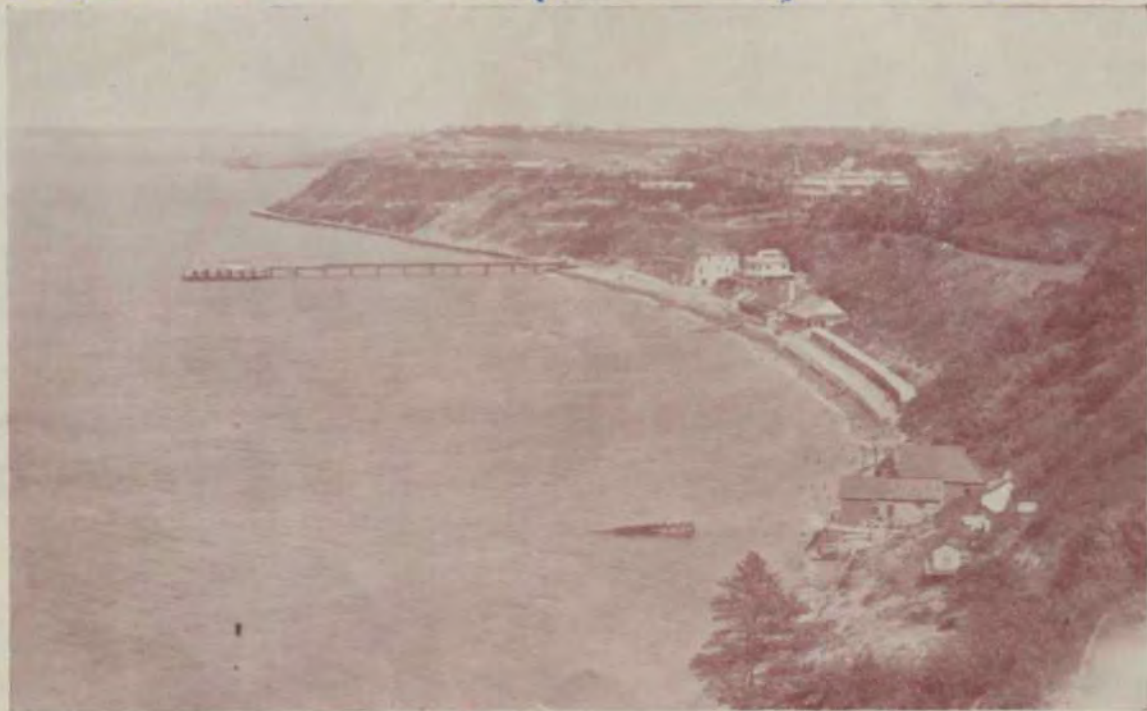
TOTLAND BAY which adjoins Colwell Bay.