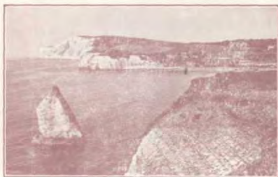
Stag Rock—Freshwater Bay.