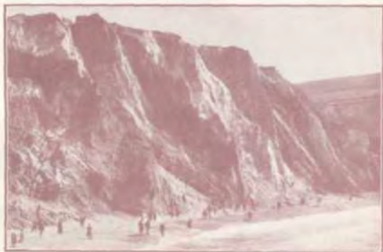
Alum Bay—The Coloured Cliffs.